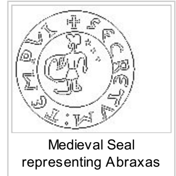
Medieval Seal representing Abraxas